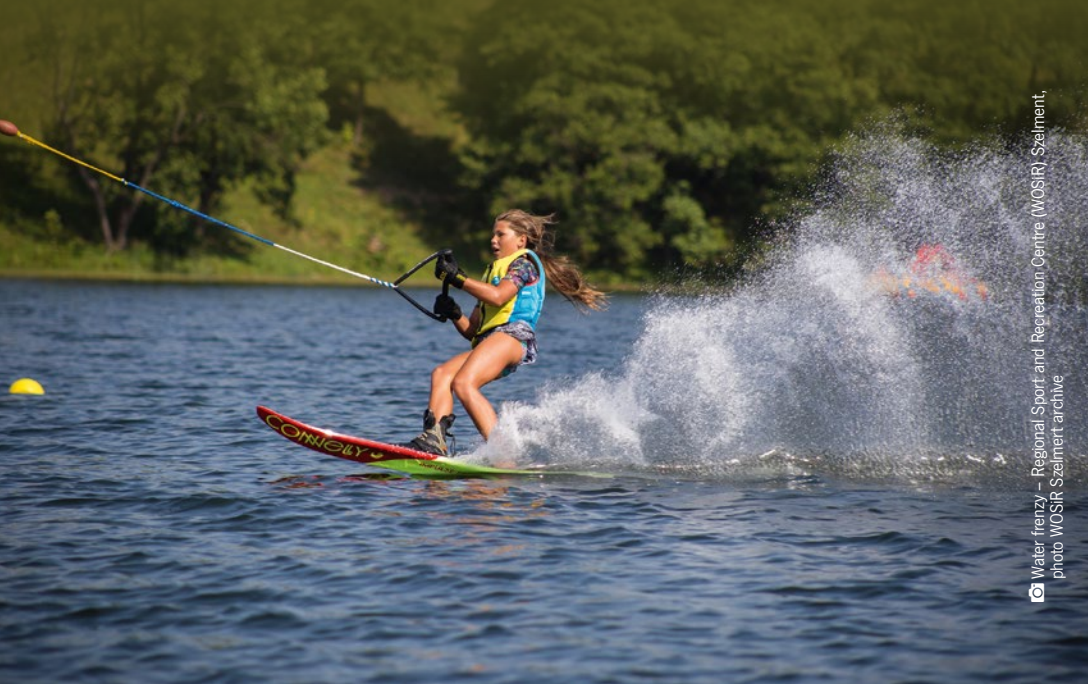
Water frenzy – Regional Sport and Recreation Centre (WOSiR) Szelment

Municipal Culture, Sports and Recreation Centre ul. 1 Maja 19, 17-250 Kleszczce Phone: +48 85 6818054 E-mail: moksirkleszczce@gmail.com