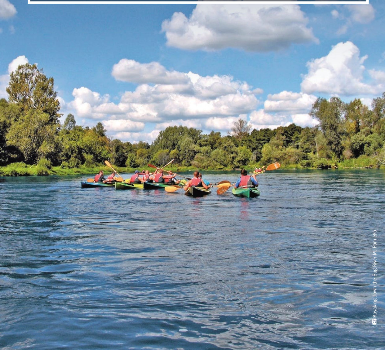
Kayaking down the Bug River.

A wealth of nature in the Podlaskie rivers is best seen from a close perspective, e.g. when kayaking. You can also set off on a rafting trip down the Biebrza River. On the Narew River you will be surprised to see traditional boats known as psychówki . The Biebrza River is surrounded by vast swamp and peat bog areas, nesting birds and the king of this land – the elk. The meandering Narew with its widely branched river bed and surrounding marshlands, is known as "the Polish Amazon". The Bug River will take the visitor to the picturesque and culturally attractive southern part of the region.