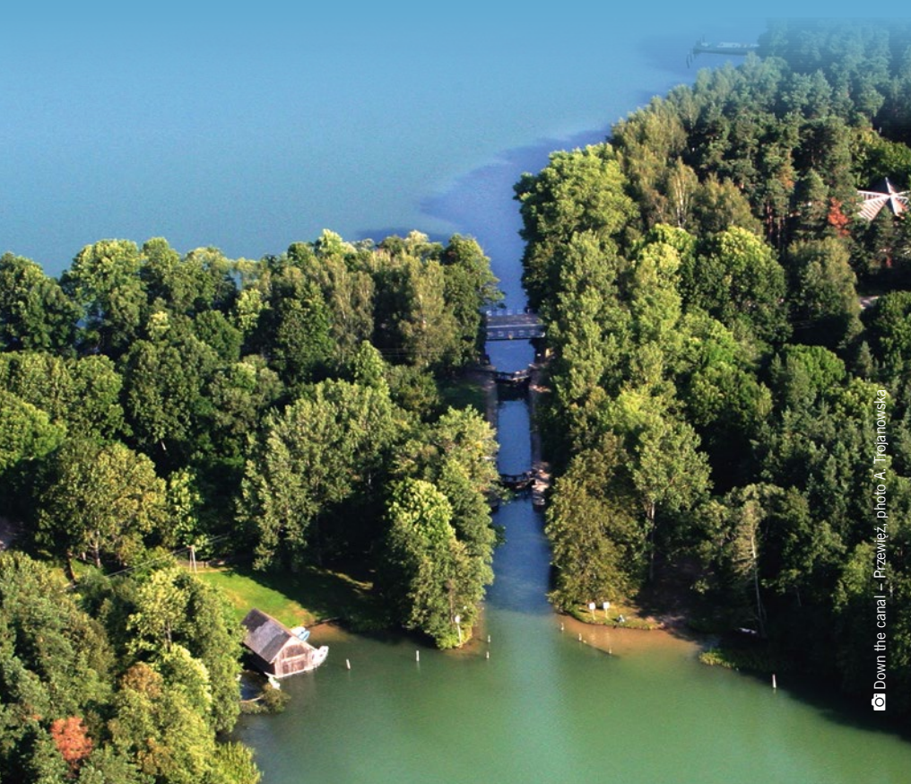
Down the canal – Przewięź, photo A. Trojanowska

border (Kurzyńie). The canal is a 19th-century historic landmark. You can learn the history of its construction at the Museum of History of Augustów Canal , one of the branches of the Museum of the Augustów Region.