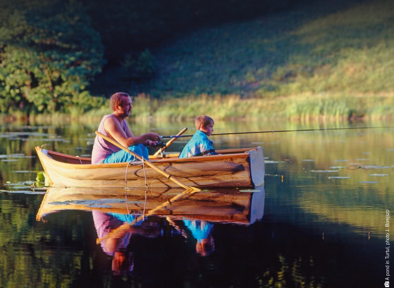
A pond in Turtul, photo J. Borejszo

Fisheries situated on numerous lakes and rivers of the Podlaskie Region are great attractions for anglers visiting the region. The impressive Siemianowka water reservoir is a particular attraction for angling enthusiasts. The northern part of the region offers excellent fishing opportunities in Augustów lakes or at centres specially tailored to the needs of "angling leisure", e.g. at Lake Boksze. Delicious freshwater fish dishes are also served in numerous regional restaurants.