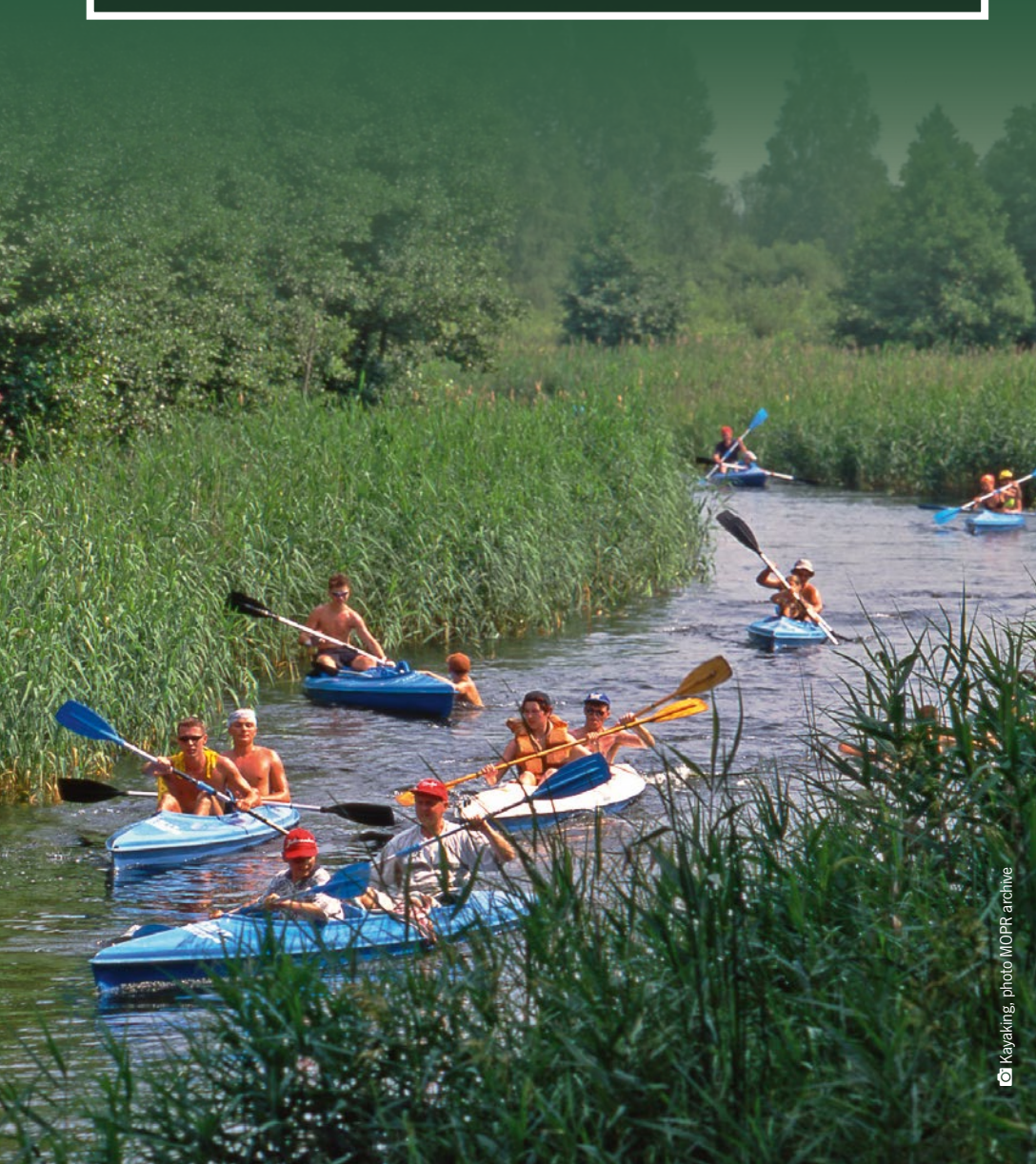
Kayaking

Many lakes and picturesque rivers offer perfect opportunities for tourists who prefer water leisure kayaking down the Sokółda or Biebrza Rivers where you can enjoy the closeness of nature and admire the wooden architecture of Podlaskie countryside. Modern water ski lifts in Augustów, Szelment, and Wasilków are perfect to enjoy water sports.