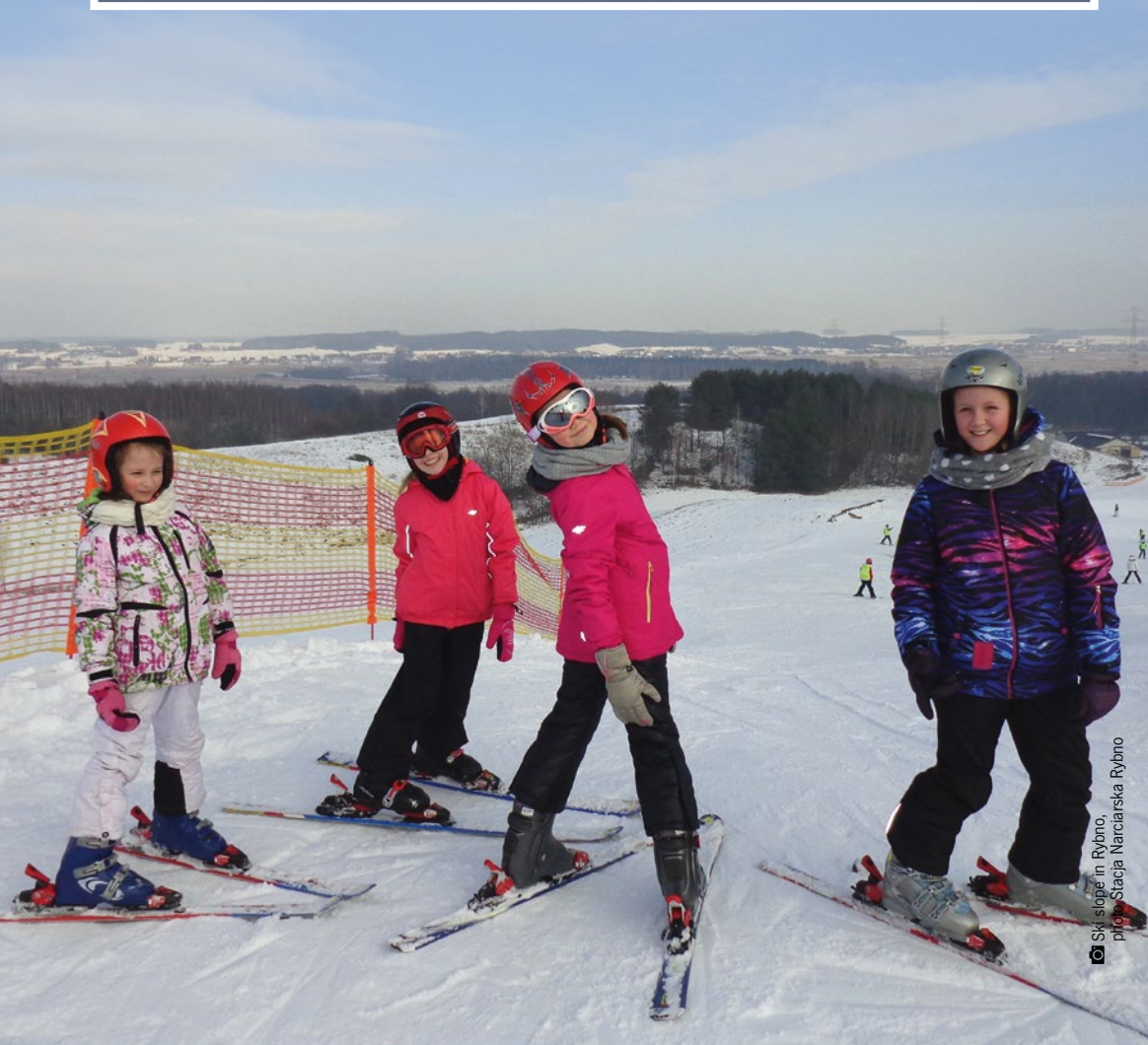
Ski slope in Rybno

Skiing Station have various downhill skiing trails and provide ski hire and service. Beginner skiers are offered skiing lessons. The WOSiR Szelment is situated on Jeleniowa Hill (a natural elevation, 252 m above sea level)